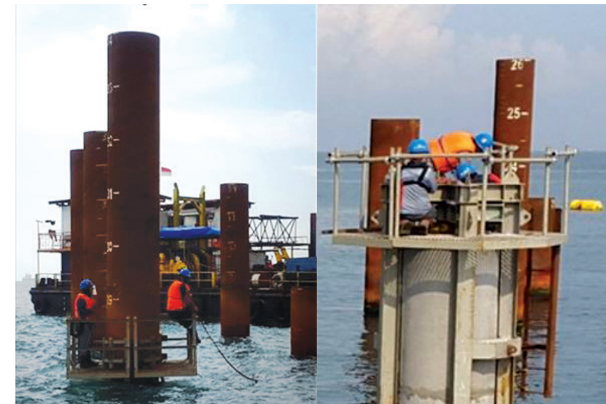
Proper platform for enhanced safety during cutting of piles (a luxury in the Indonesia construction since working platform normally consists of few pieces of timber planks)

In maritime term, "A smooth sea never made a skillful sailor" but for the piling team for the ASC Coal Jetty Project, "A calm water never made a skillful piling crew". Working under rough conditions in an open sea with swells of up to 1 m high, the piling crew delivered the project with precision, ahead of schedule and importantly, achieved a zero incidents record for this high-risk activity. Skills and safety are a potent combination simply because HSL can deliver better, faster, and safer.