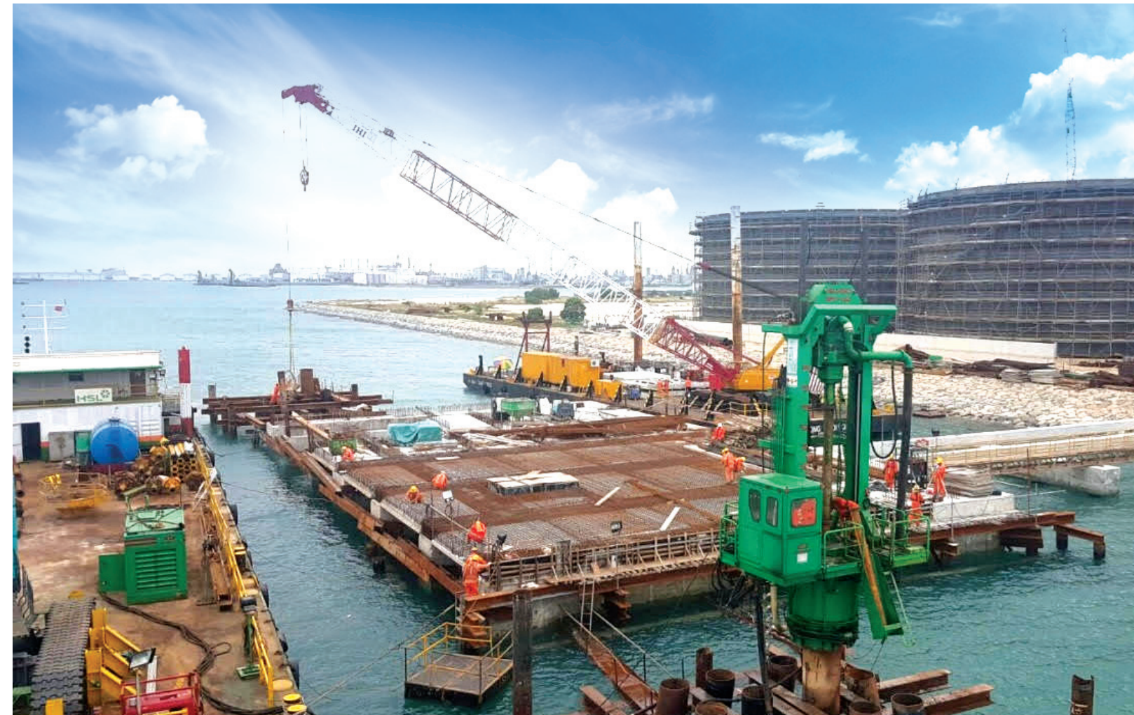
Aerial Photo of Berth