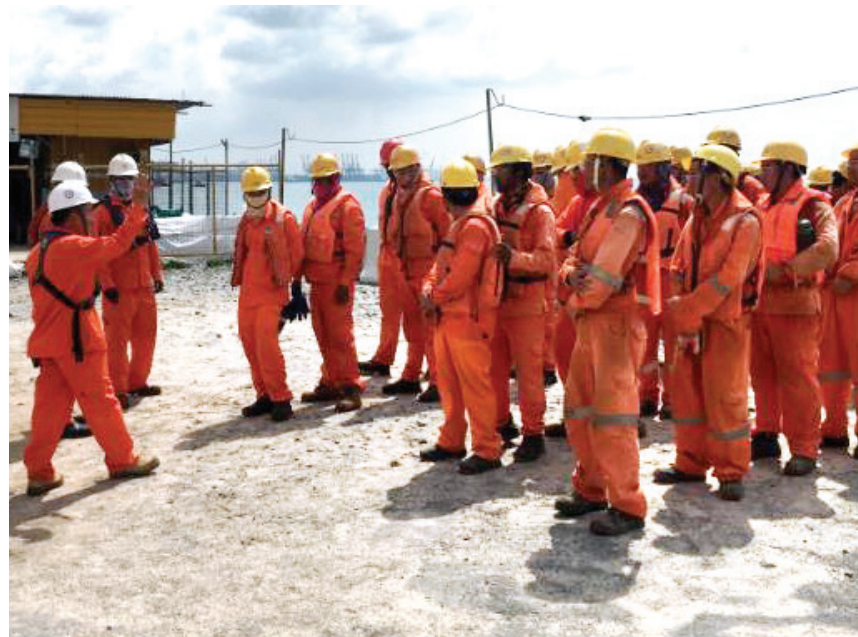
Headcount was conducted in a timely manner

Man Overboard drill is conducted to allow working personnel to familiarize themselves with emergency situation response and recovery.