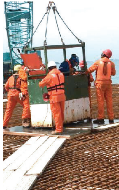
Casualty was transferred to Berth area using man cage