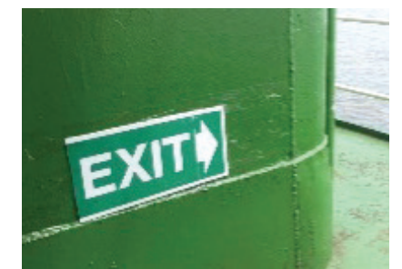
Various safety signage in around the barge