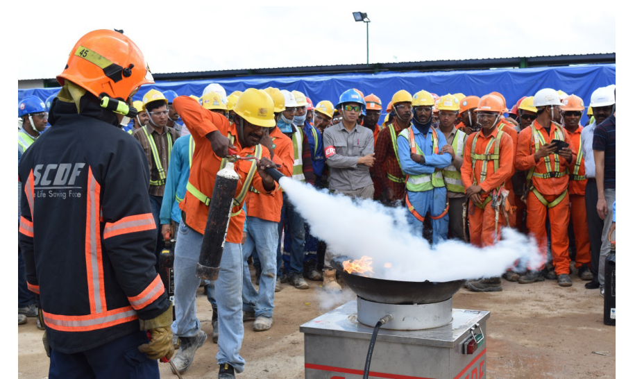
Site personnel were given the hands on experience to use a fire extinguisher