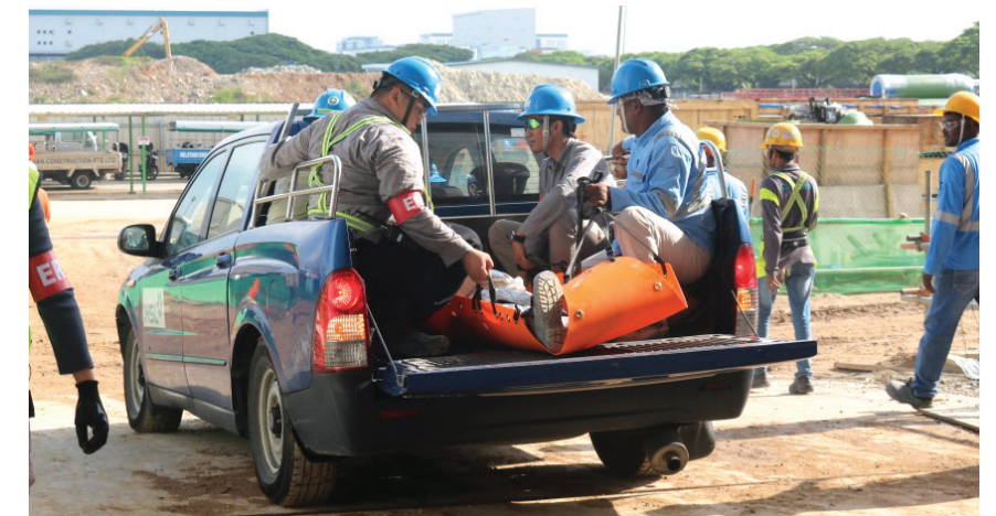
IP was transferred to first aid room using emergency vehicle