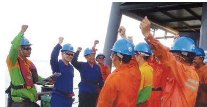
Multi-language communication via translators and written messages to enhance safety and coordination for stakeholders from Indonesia, China, Japan --- BERSAMA KITA BISA / TOGETHER WE CAN / 一起我们可以

In maritime term, "A smooth sea never made a skillful sailor" but for the piling team for the ASC Coal Jetty Project, "A calm water never made a skillful piling crew". Working under rough conditions in an open sea with swells of up to 1 m high, the piling crew delivered the project with precision, ahead of schedule and importantly, achieved a zero incidents record for this high-risk activity. Skills and safety are a potent combination simply because HSL can deliver better, faster, and safer.