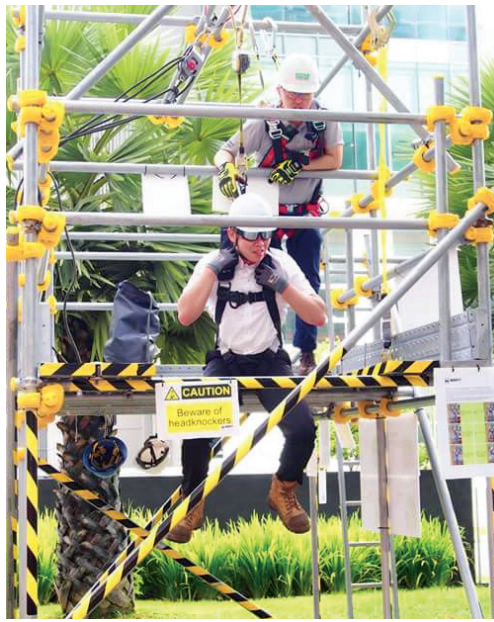
External vendor, United Resources Pte Ltd conducted a Work at Height demonstration